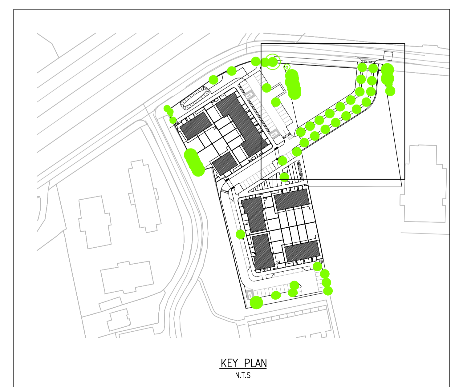
KEY PLAN N.T.S.